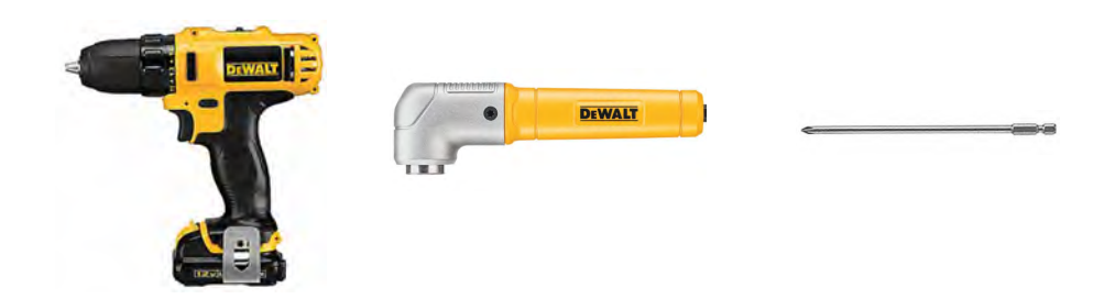
Option 2) Flexible Screwdriver with Philips Insert Bit.

Option 1) Cordless drill and an elbow or L-shape adapter with Philips Insert Bit extension.